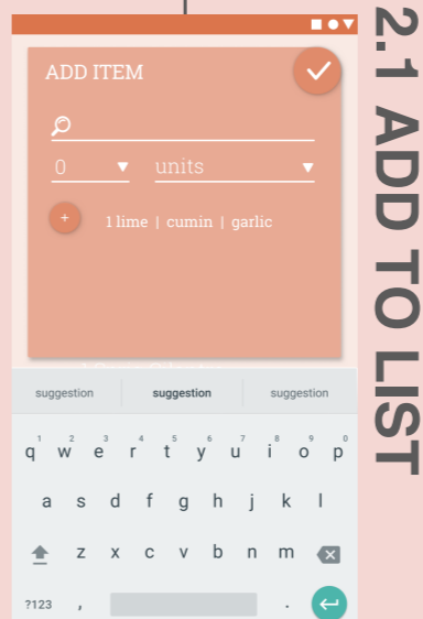
2.1 ADD TO LIST