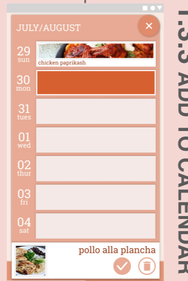
1.3.3 ADD TO CALENDAR