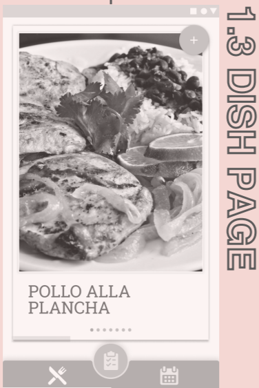
1.3 DISH PAGE