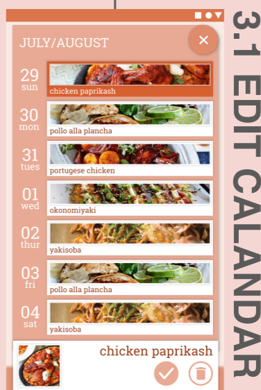
3.1 EDIT CALENDAR