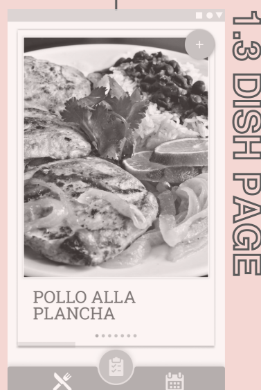
1.3 DISH PAGE