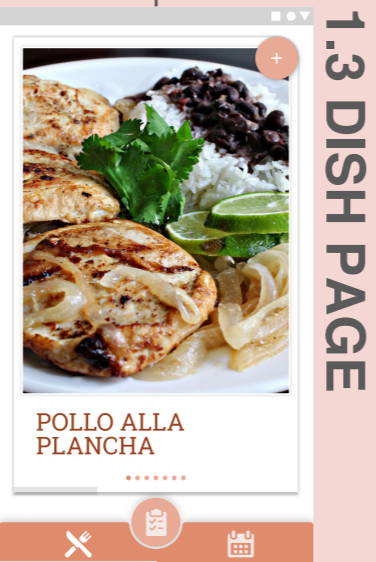
1.3 DISH PAGE