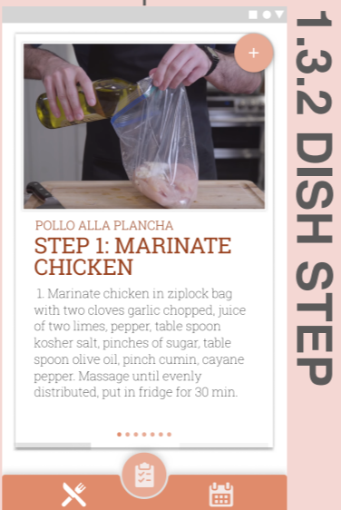
1.3.2 DISH STEP